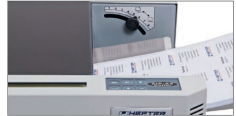
Easy operation and individual adjustment of the paper thickness

The cutted cards are stacked in an adjustable tray and are easily accessible for the operator. The cutting and slitting knives are extremely strong, and ensure an always professional look of the cards, even after a high quantity of cuts.