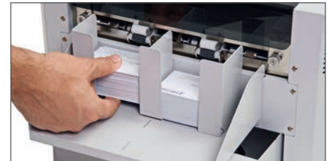
Infinitely variable, magnetic, stacker