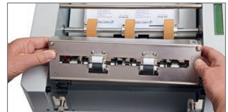
The blade magazine can easily be removed and changed, e.g. for perforating or creasing blades